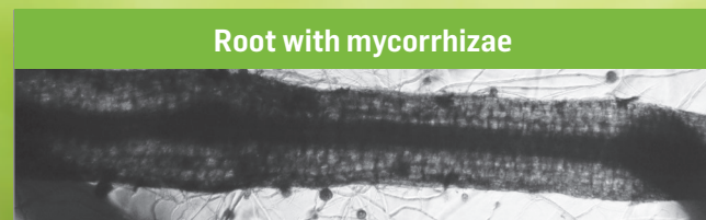
Root with mycorrhizae