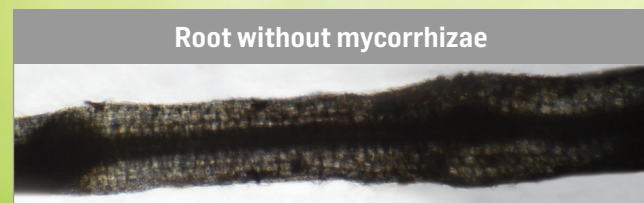
Root without mycorrhizae